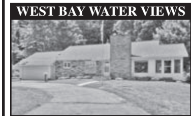
WEST BAY WATER VIEWS

RANCH STYLE HOME located in a great location in between Suttons Bay & Traverse City, & directly across from Public Park with beach access. Home features 3 BR, 1.5 BA. Main floor living conveniences, hardwood flooring, picture windows, 3 seasons room. 1.83 acres with additional detached 20x30 storage building. $295,000 (1850567)