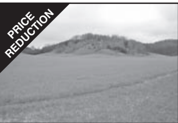
N Lake Leelanau Drive

42 beautiful gently rolling acres overlooking the Village of Lake Leelanau and South Lake Leelanau. Currently is Agricultural production with approximately 10 acres of cherries and 10-15 acres of hay. Several excellent building sites possible. All property splits are included and large irrigation well. MLS# 1831139 $275,000