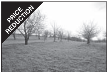
00 Eagle Highway

Gently rolling plateau with tremendous views of South Lake Leelanau from this 90 +/- acres, the Village of Lake Leelanau and countryside. Currently in sweet cherries and hay. Nicely wooded and open area to expand farming or pasture horses. Outstanding opportunity for your private estate yet close to all amenities. MLS# 1825806 $747,000