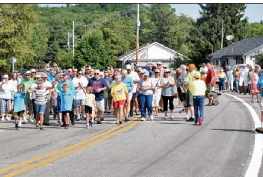
Participants stroll the Glen Lake bridge walk.