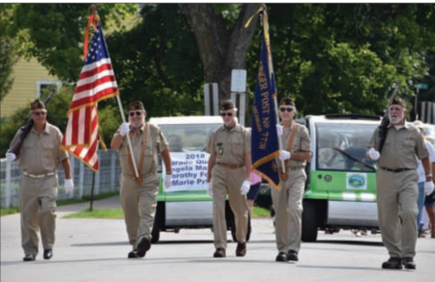
LEADING THE 20th annual Leland Bridge Walk on Labor Day this year were members of Veterans of Foreign Wars Post 7731 from Lake Leelanau.

A couple blocks requiring a leisurely stroll of about five minutes — were awarded a certificate of achievement. The march began at the state boat launch parking lot on the Leland River and ended on the lawn of the Old Art Building.